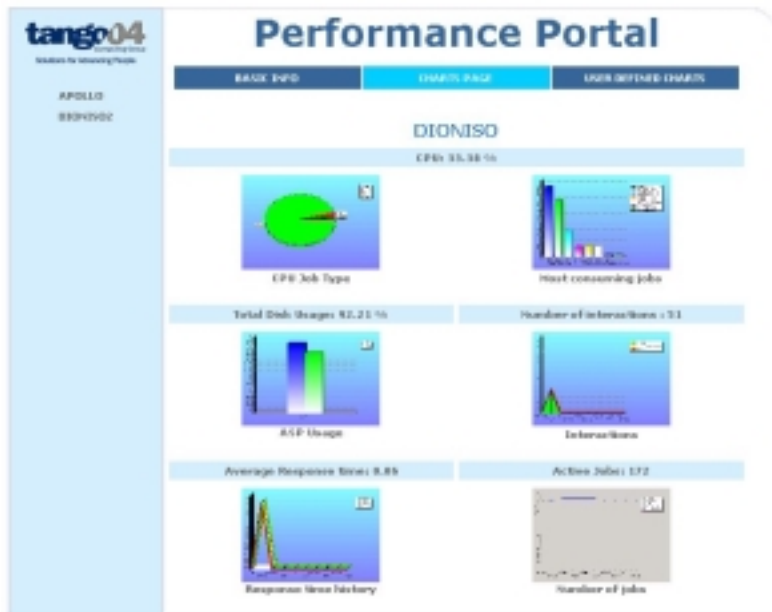
Fig 2. Tango/04 VISUAL Control Center generates web-based graphics of iSeries key performance metrics to produce Performance Portals that can be accessed wherever there is a web browser.