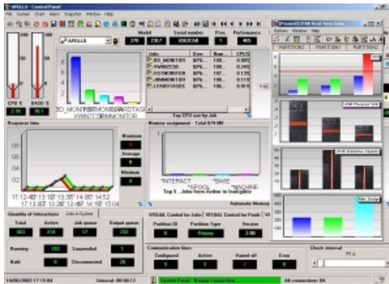
Fig 1. Tango/04 VISUAL Control Center provides a performance management 'cockpit' from which multiple iSeries servers and logical partitions (LPARs) can be supervised in real-time

The following are four screen-shots of VISUAL Control Center that are available to editors as JPG files just by contacting marketing@tango04.net . Each includes a suggested photo caption that depicts the contents of each picture.